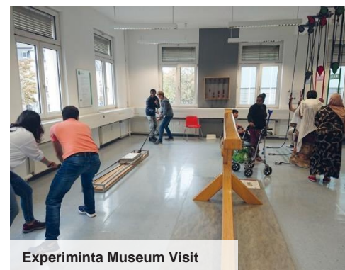
Experimenta Museum Visit

It was so nice with you and we were very happy that many of you joined us. See you soon! In TWO weeks it will be breakfast and speaking again.