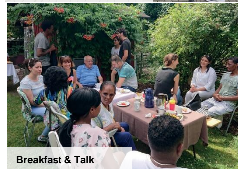
Breakfast & Talk