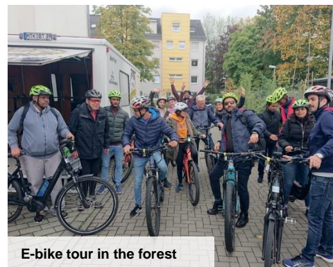
E-bike tour in the forest