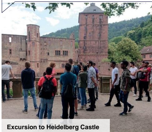
Excursion to Heidelberg Castle