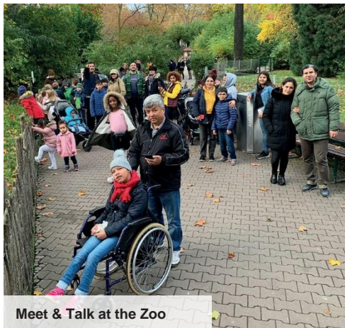
Meet & Talk at the Zoo