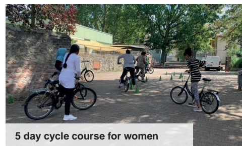
5 day cycle course for women