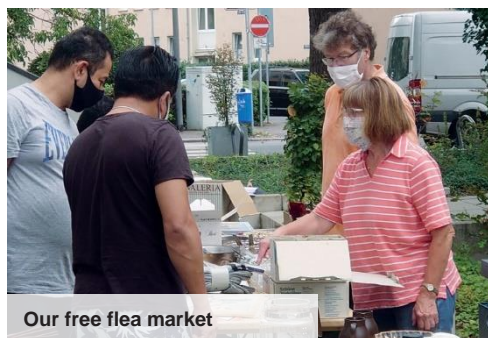
Our free flea market