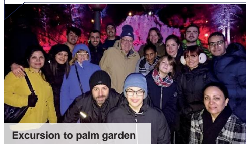
Excursion to palm garden