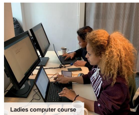
Ladies computer course